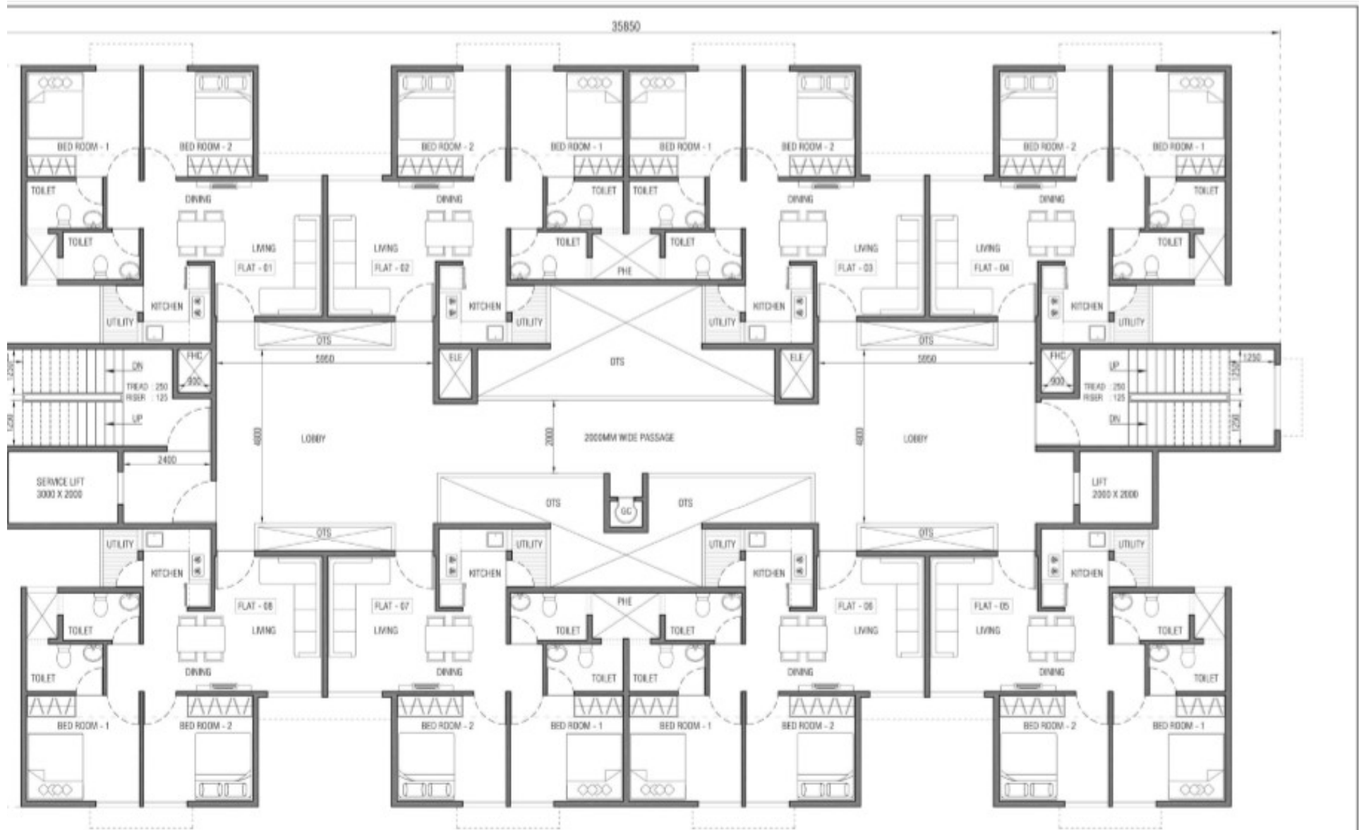
2BHK - TYPICAL FIRST TO SIXTH FLOOR PLAN