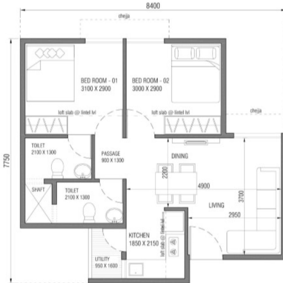
2BHK UNIT PLAN